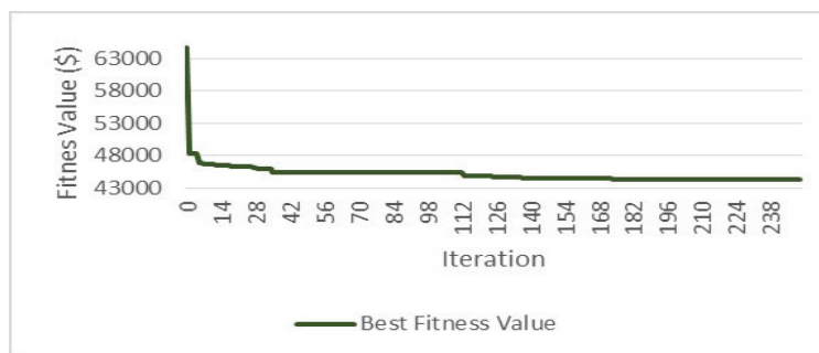
Figure 5: The PSO best fitness value for case 1 with 250 Iterations and 140 population

For the PSO there are 32 combinations of the population (P), iteration (G), and cases. The best solution for case 1 is derived from 250 iterations and 140 population. The best fitness values for case 1 is shown in Figure 5. The solutions show that the longest iteration for getting the best fitness values convergent is 198 iterations, therefore we set the number of iterations to be 250 to guarantee that the best fitness value has been convergent. The best fitness value of PSO is 32.14% better than the initial solution.