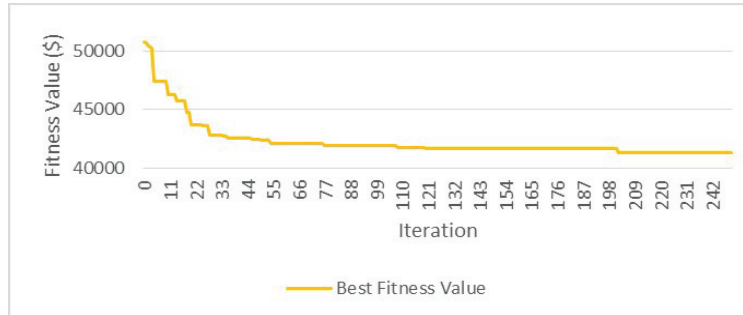
Figure 4: The best fitness value for case 2 with 250 Iterations and 140 population

Figure 4 shows that the GA is not trapped to local optimal easily. The two cases show that, at least, the solutions convergent at the 200th generation. We set the number of generations equal to 250 to guarantee that the solution has been convergent and the best solution is 18.65% less than the initial fitness value. Therefore, the GA results in a significant improvement compared to the initial solution.